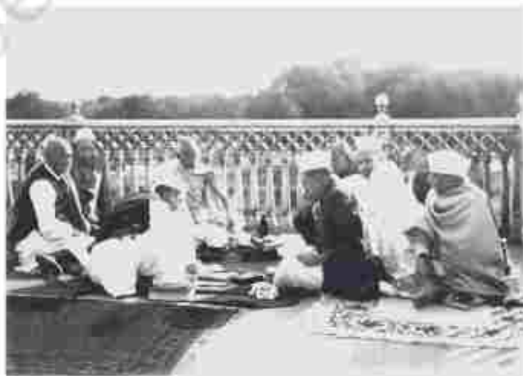
Fig. 6 - Meeting of Congress leaders at Allahabad, 1931. Apart from Mahatma Gandhi, you can see Sardar Vallabhbhai Patel (extreme left), Jawaharlal Nehru (extreme right) and Subhas Chandra Bose (fifth from right).

Lala Lajpat Rai was assaulted by the British police during a peaceful demonstration against the Simon Commission. He succumbed to injuries that were inflicted on him during the demonstration.